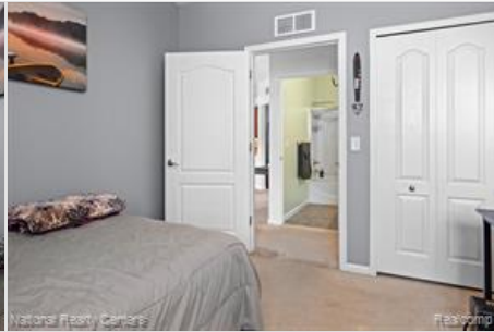
2nd BR toward Bath