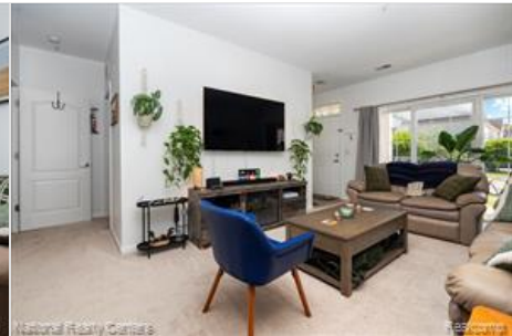
Living Room/View toward Bedroom 2