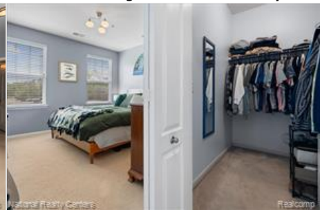
Walk In Closet/Primary BR