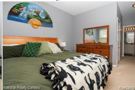
Primary BR toward Full Bath