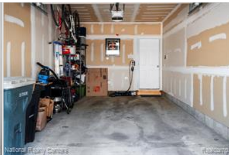
One Car Attached Garage