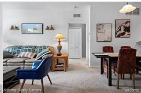
View from Living Room toward Primary BR