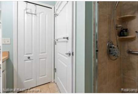
Primary Full Bath