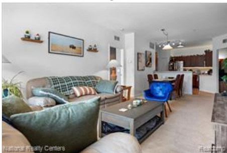
Living Room/View toward Kitchen Area