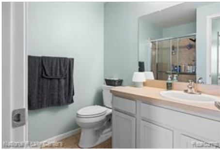
Primary Full Bath