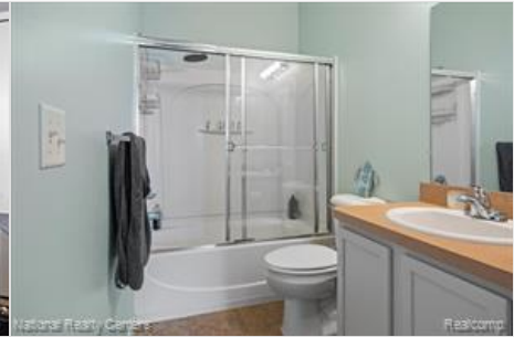
2nd Full Bath