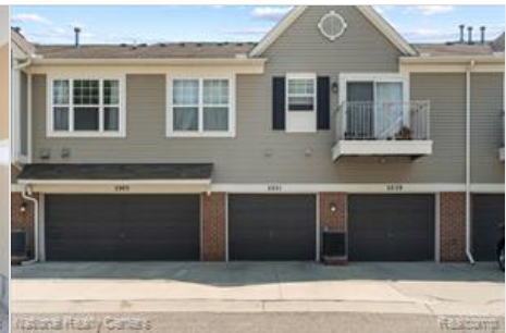
Garage View from Driveway