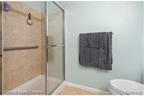
2nd Full Bath